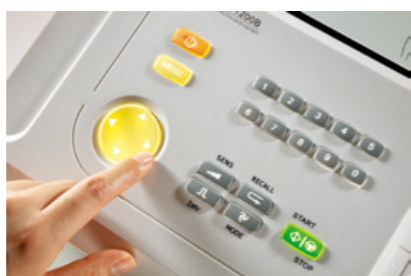
Alphanumeric keyboard; Back light for button