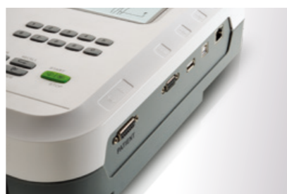
Memory of 300 ECG records; USB for data transmission; PC-ECG management system