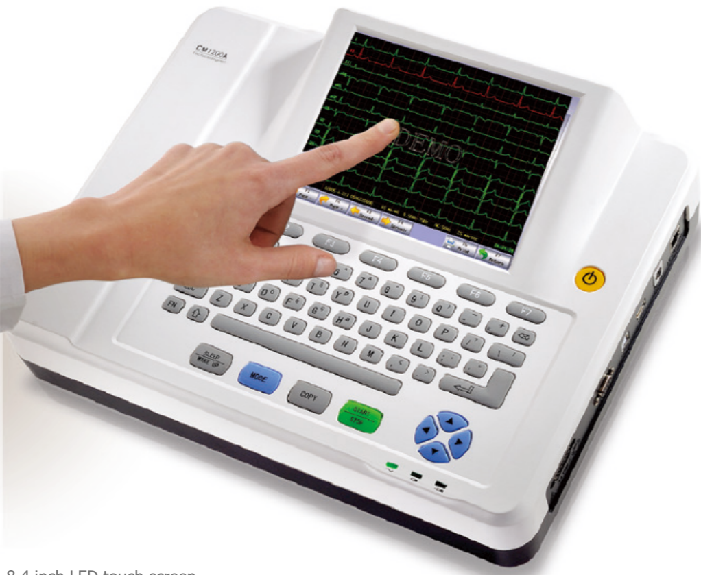
8.4 inch LED touch screen