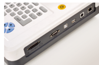
Memory 300 ECG records; USB for data transmission; Support PC-ECG software; Support external printer connection